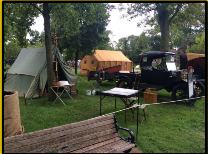
Model A Snowbird conversion.