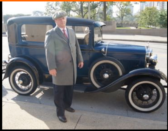
The Carp, Editor in Chief

Well I needed to take a month off writing this newsletter, as I didn't seem to have enough hours in the day. I'm going to have exposure trip details this month and next month I will have the Fall Trip details.