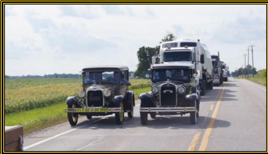
Just west of Alvordton, Ohio

You never know what you will see along the way. This is someone's man cave! Fayette, Ohio